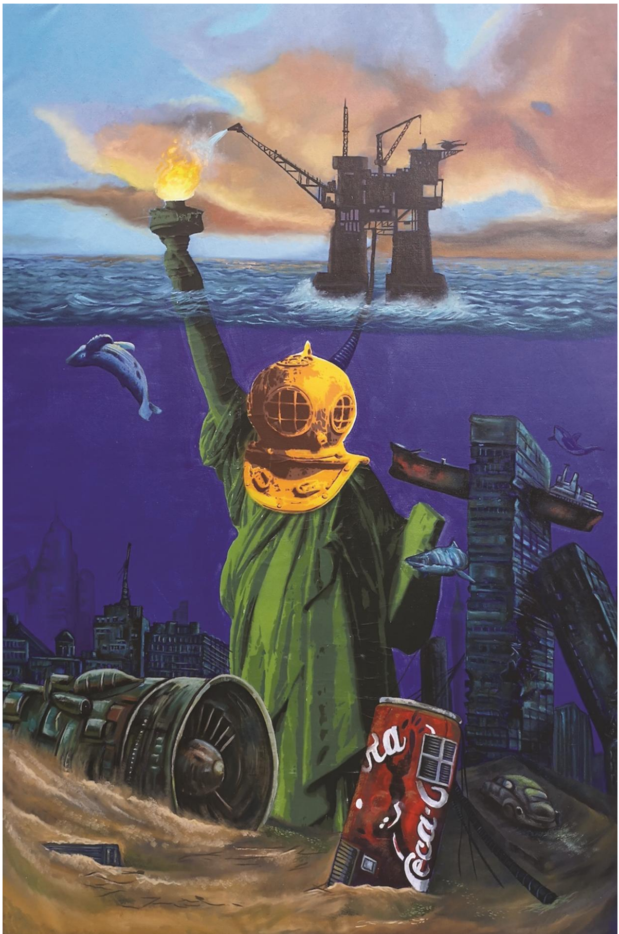
THEA LANG COLLECTIVE "Freedomsucker"

Oil and Stencil on Canvas 140 cm x 110 cm